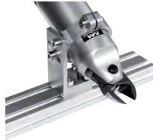
Air nipper GT-NR20 assembled on extrusion SLine