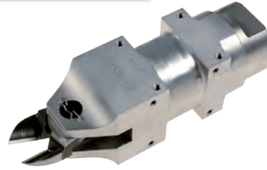
Air nippers, square