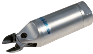
Air nippers, round