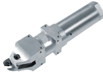
Air nippers GT-NS20 with pressure booster