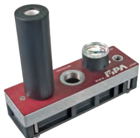
Application example: Multi-chamber ejector with vacuum gauge 91.001 (mounting on front or rear side)

High suction power for fast vacuum build up with porous workpieces