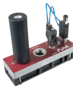
Application example: Multi-chamber ejector 65.340-LSE with air saving function