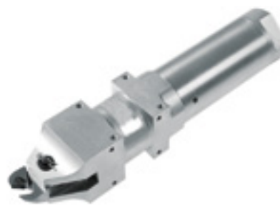
Air nippers GT-NS20 with pressure booster