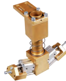
GR04.720 with spring load